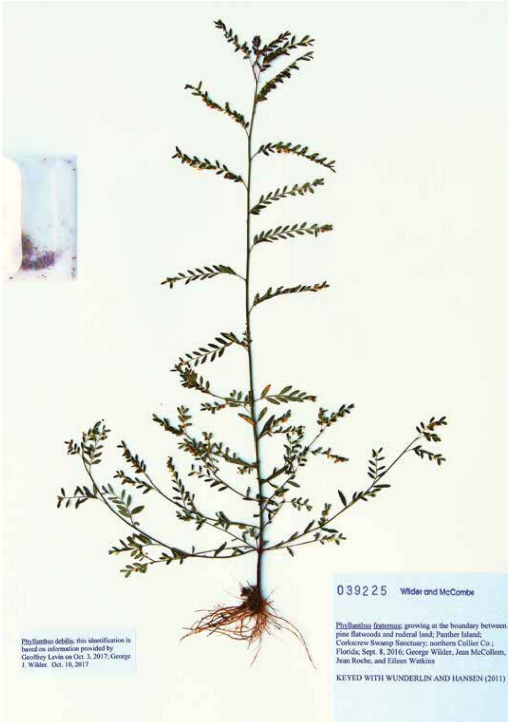
Fig. 2. Photograph of Phyllanthus debilis , taken from Wilder and McCollom 39225 (SWF).